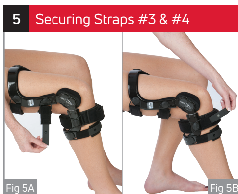
Neoprene Strap Kit